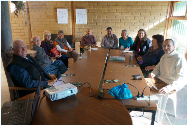
Armidale Tree Group Members

Armidale Tree Group are likely to become a Regional Provider. Covering the area of Armidale, Walcha and Uralla.